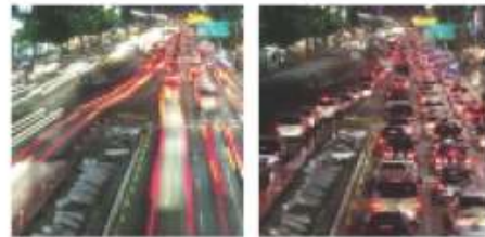
Reformation Ghost Effect