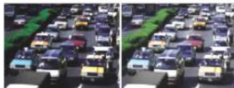
480 TV Lines