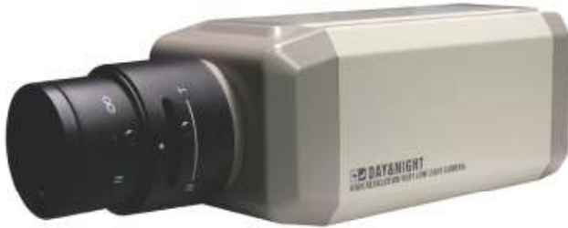
HSCS-415DN HSCS-415DU(Dual Voltage)