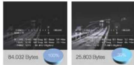
70% Disk Saving