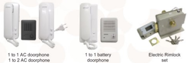
1 to 1 AC doorphone 1 to 2 AC doorphone

Accessories : Push button plate, additional remote control transmitter.